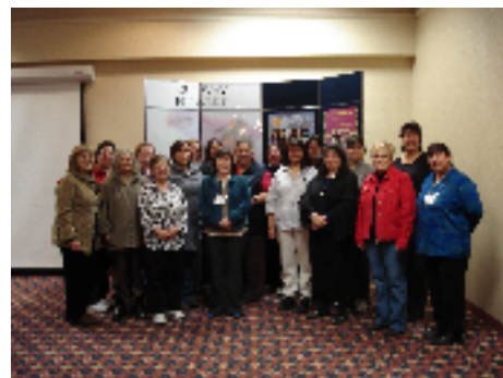
Leadership Summit Level One

A mentor program will be introduced to assist First Nation clients in receiving the support of a colleague.