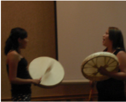
First Nation Drummers OLS-North Conference

OLS-North will continue to offer training to meet the needs of First Nation clients in a culturally sensitive manner.