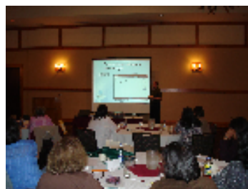
FN Library Conference

OLS-North would expand its organizational structure to include a service unit designated for First Nation Library Service. This unit would be managed by a Director responsible for First Nation Service with