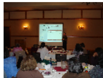
OLS-North Conference 2008

The proposed model would provide continued technological growth through the use of in house expertise. They would have specialized training, help desk support and assistance with the development and maintenance of websites.