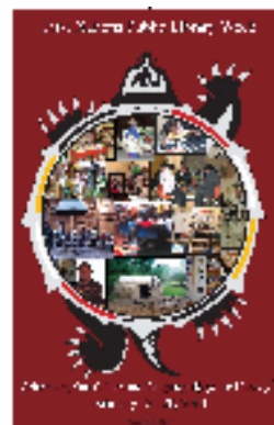
First Nation Public Library Week Poster 2010

OLS-North also designed the original strategic plan and many of the products which have been initiated from the plan.