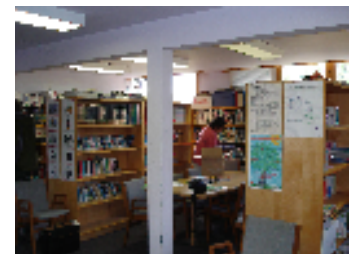
Wasauksing First Nation Library